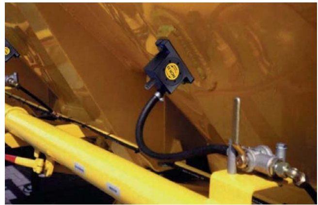
Emptying silo trailers