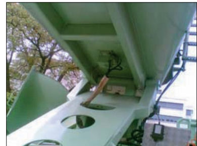
NHG 900 L