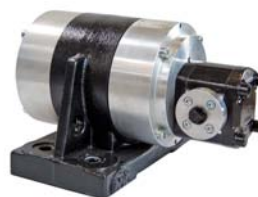
NHG 3000 L