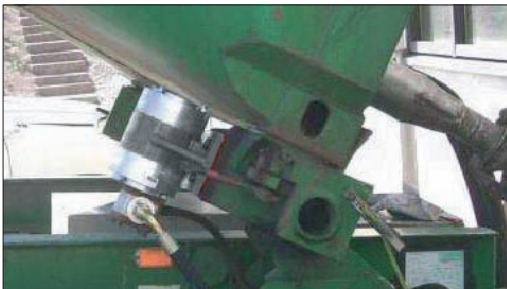
NHG 3000 L