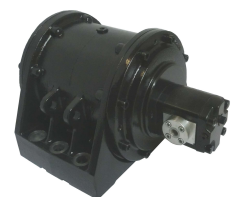
NHG 6000 L