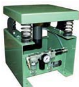
VTP 3/3 with NTS 350 NF pneumatic