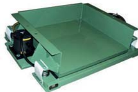
VTF 8/8 with 2 NTS 50/08 flat design