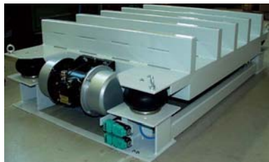
VTF/R 10/12 with 2 NEG 251370 E for applications conforming to ATEX