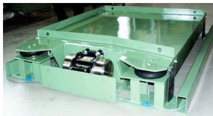
VTH/W 12/12 with 2 NEG 501510 for a weighing machine

NetterVibration offers the accessories required for the mounting, installation, control and monitoring of vibrators and vibrating tables.