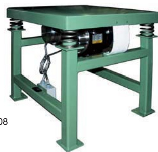
VT 7/8 with 2 NEG 50770 electric